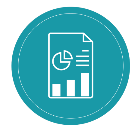
Provide leading edge practice & research