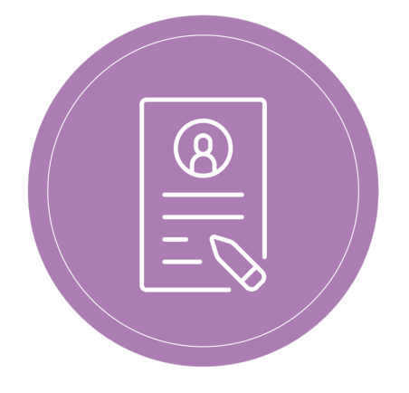
Lead talent management for our profession